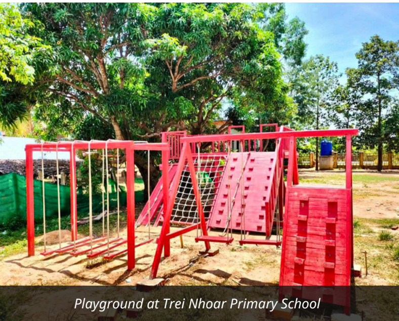
Playground at Trei Nhoar Primary School