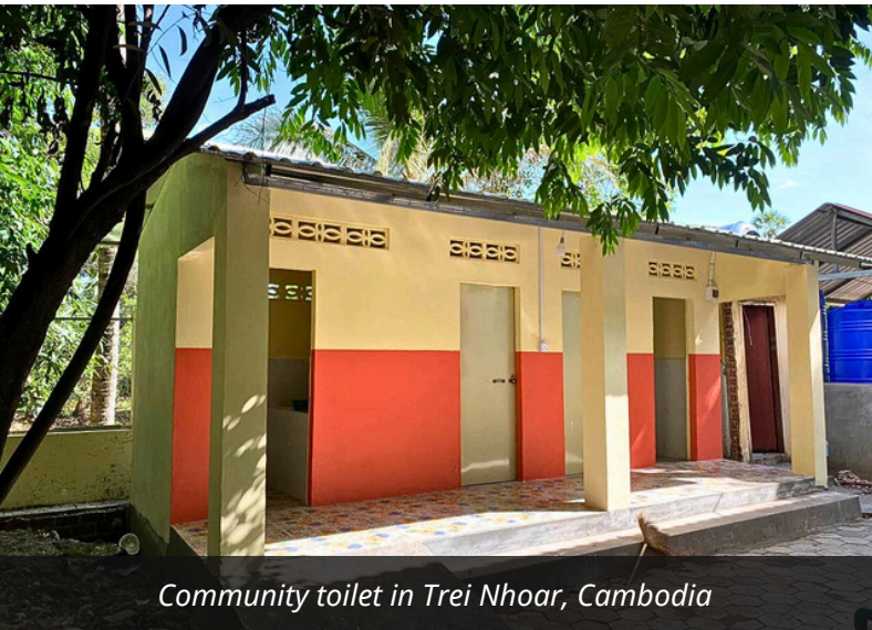
Community toilet in Trei Nhoar, Cambodia

Projects are usually a limited activity to achieve a specific goal within a specified time frame. This might entail building a school or other village infrastructure or providing professional services. In the financial year 2024, Discova Education Travel successfully managed projects in Vietnam, Cambodia, Laos, and Thailand worth USD 138,093 which focussed on strengthening the education, economy, and healthcare of the local communities we worked in.