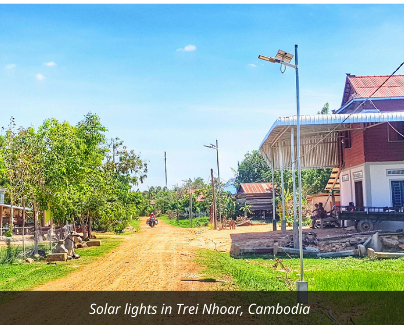
Solar lights in Trei Nhoar, Cambodia