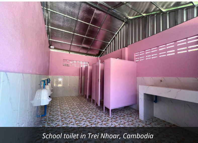
School toilet in Trei Nhoar, Cambodia