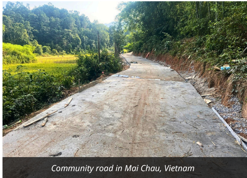
Community road in Mai Chau, Vietnam