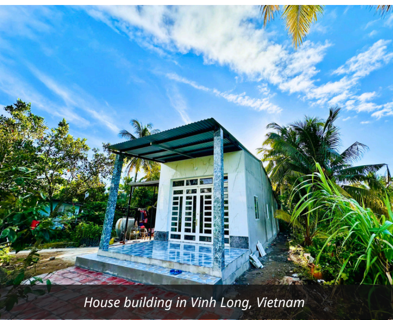
House building in Vinh Long, Vietnam