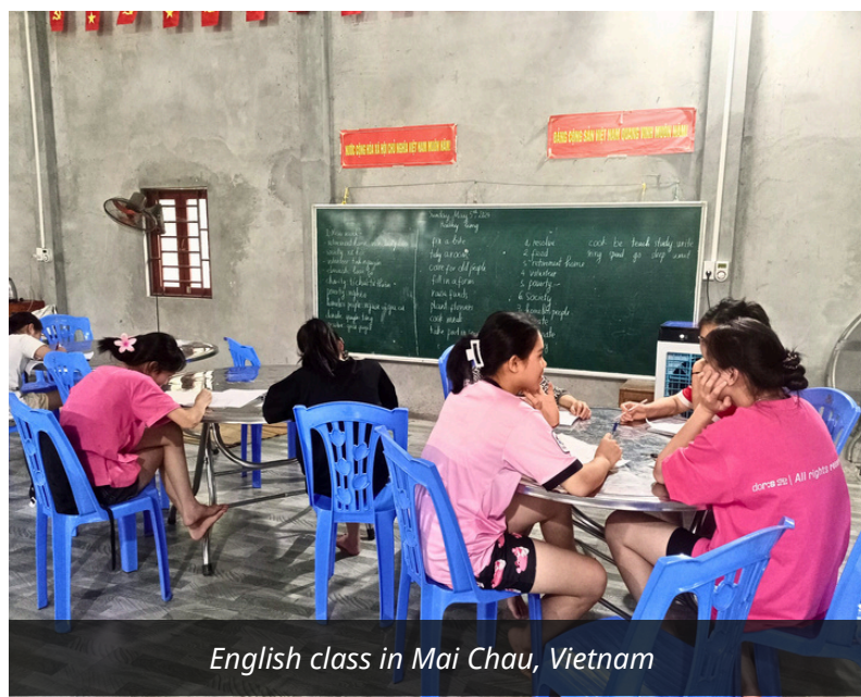
English class in Mai Chau, Vietnam