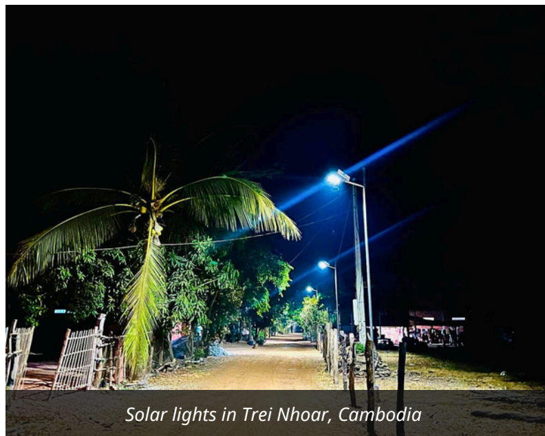
Solar lights in Trei Nhoar, Cambodia