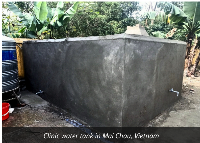
Clinic water tank in Mai Chau, Vietnam