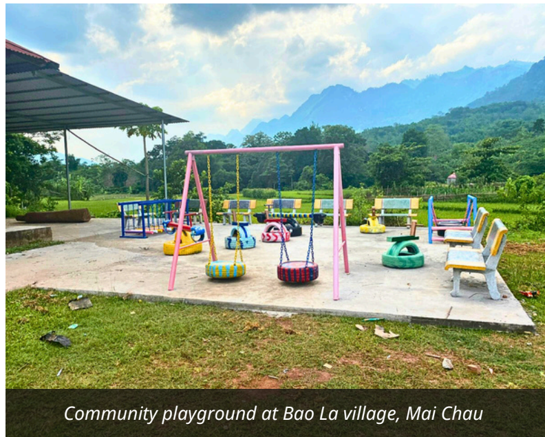
Community playground at Bao La village, Mai Chau